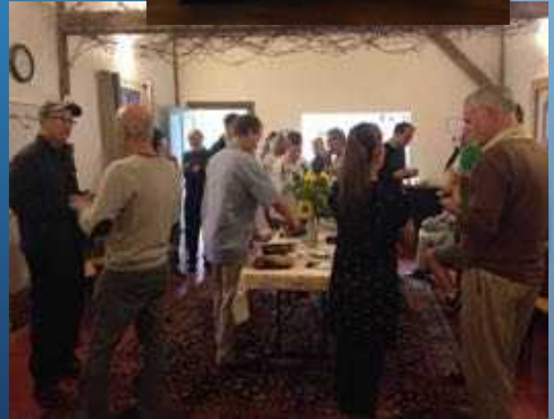
At the Fall Meet and Greet